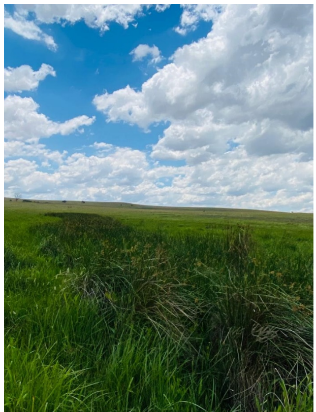
Photographs showing different wetland vegetation (24 th November 2021, Ezemvelo Nature Reserve) in the area of coordinates: latitude -25.701902; longitude 28.952475